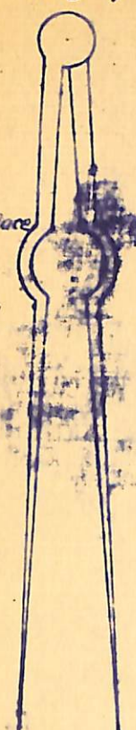
A Scale of fifteen Chains

The great street that leadeth from the wharf point to the Markell place