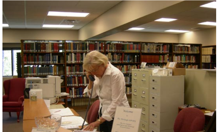
The front desk in the bright new quarters on the second floor of the Savannah Bank Building.