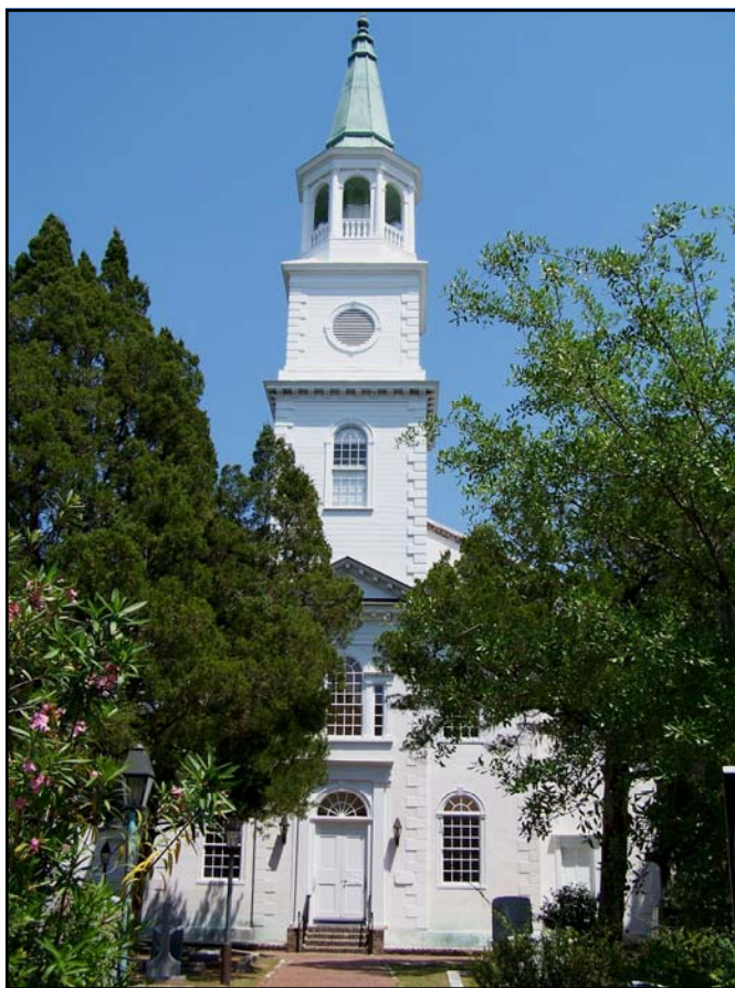
St Helena’s Episcopal Church