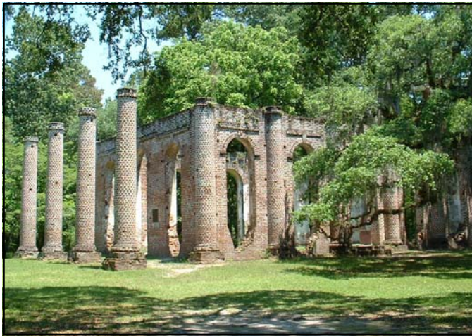
The ruins of Old Sheldon Church

Historic Houses of Worship are herein defined arbitrarily as those built in the 18 th and first half of the 19 th centuries – antebellum United States. Lowcountry is a common term applied to a loosely delineated area in the state lying along the Atlantic Ocean's coastline; and the some in the title suggests that there are probably churches that have been omitted from this survey.