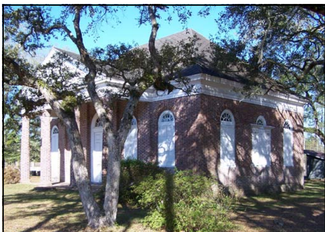
St James Santee Brick Church

A second colonial church that has but one ser-