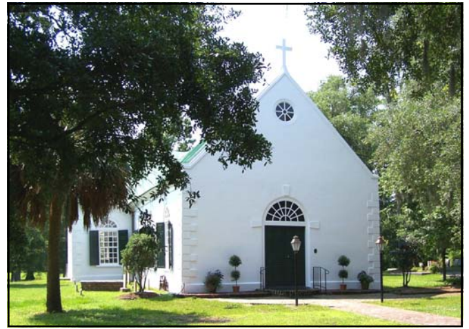
Old St Andrews Parish Church

The oldest and still active church in the Lowcountry, in fact in South Carolina, is Old St. Andrews Parish Church . It is situated on a lovely 10 acre plot (some of which is burial grounds) that is near the Ashley River and within Charleston's city