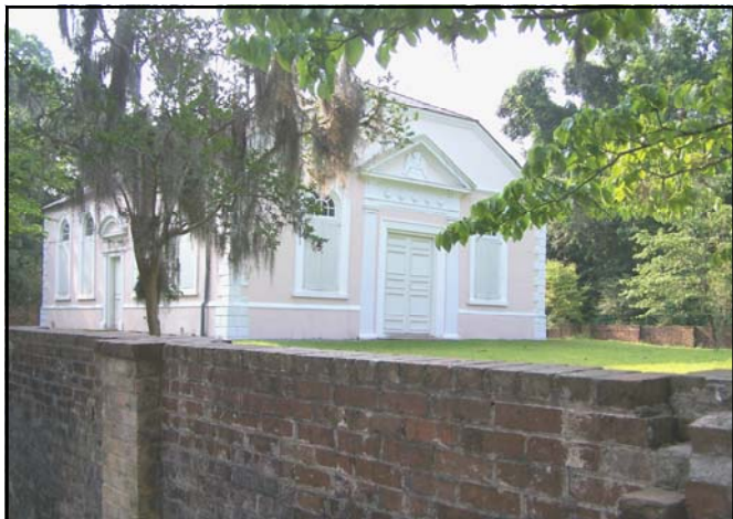
St James Goose Creek Episcopal Church