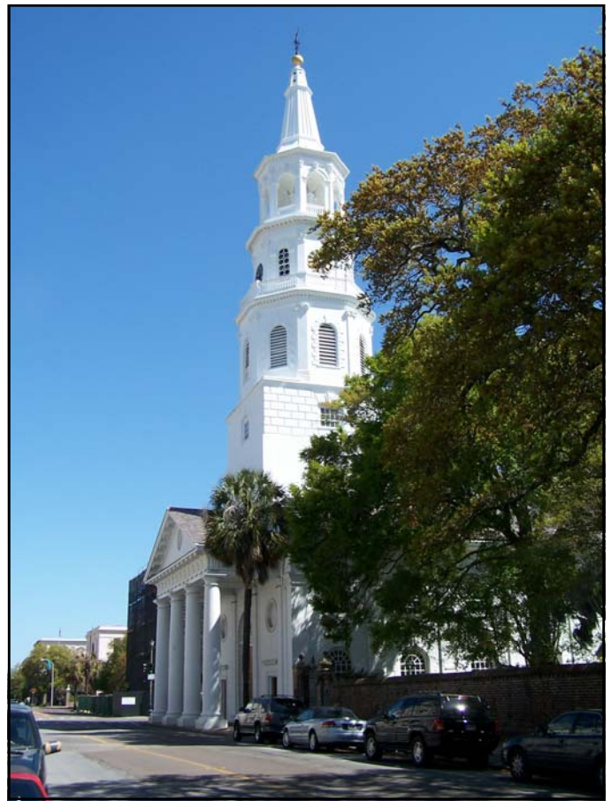
St Michaels Episcopal Church