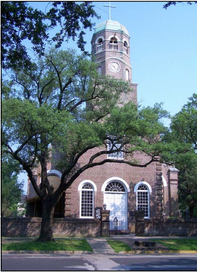
Prince George Winyah Episcopal Church