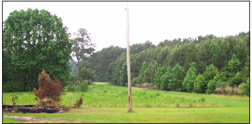
View down the trail from the Trailhead at the Lowcountry Visitors Center & Museum